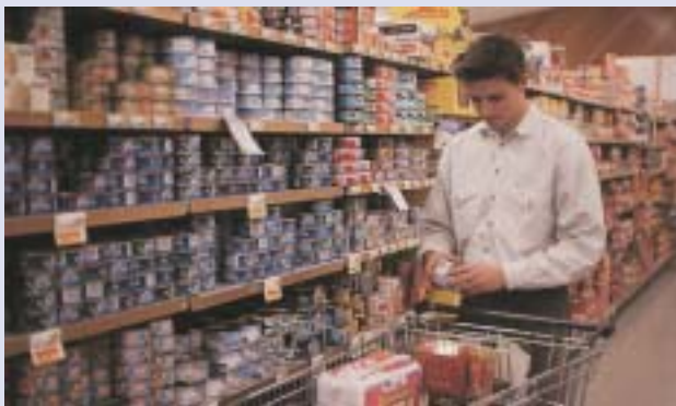
► BSE trail continued from p1

Food Focus readers will be kept informed of developments with the new food agency in future issues.